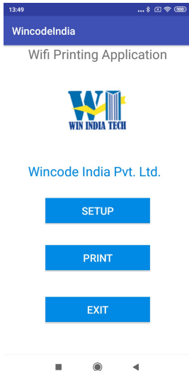
Connect Printer To Phone

Fully developed in India by the Wincode India Team Edit & send any label file to the Wincode Internet printer