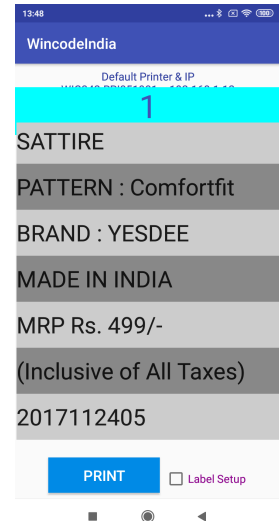
Edit Data & Send File To Printer

An Android based application that sends bar code labels to the Wincode Internet label printer. This application can carry thousands of label designs in the form of standard PRN files inside your phone. Whenever the need arises, open any label, edit the data and send the label design for printing from the phone in your pocket through the internet from anywhere!